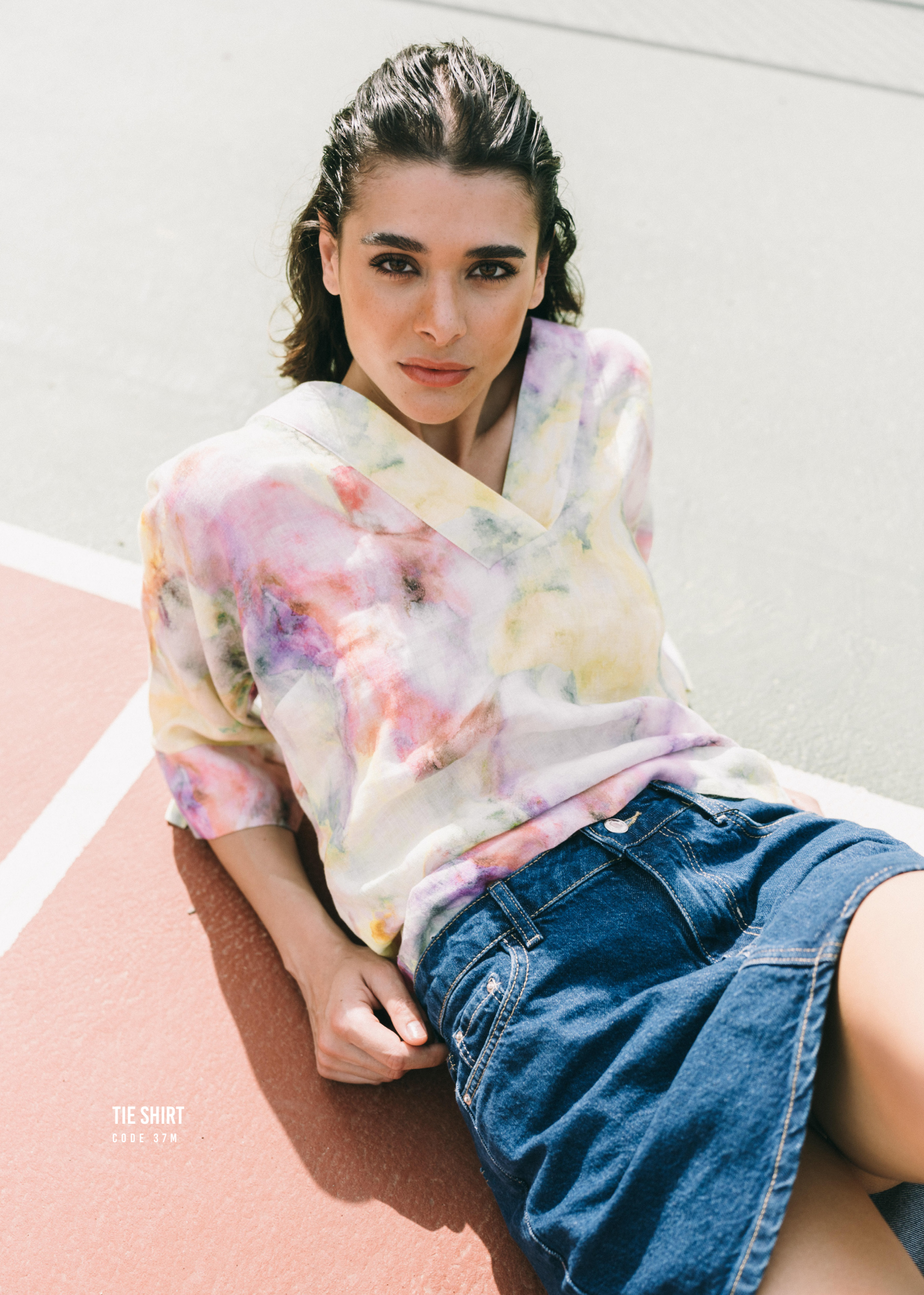
TIE SHIRT CODE 37M