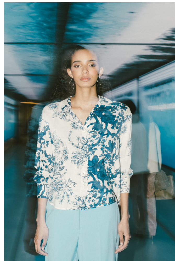
FLORAL SHIRT CODE 114