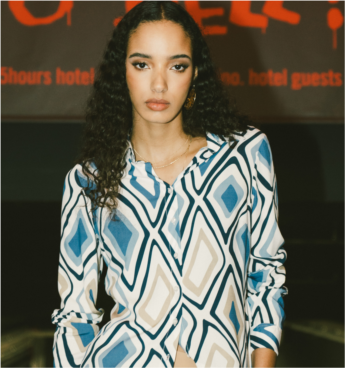
PATTERN SHIRT CODE 137