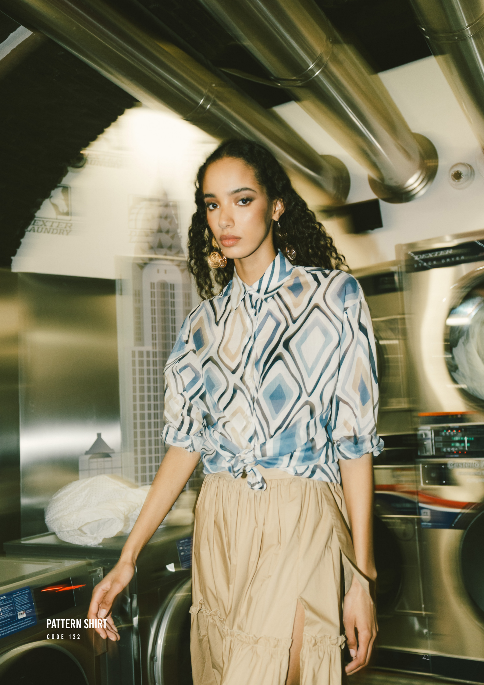
PATTERN SHIRT CODE 132