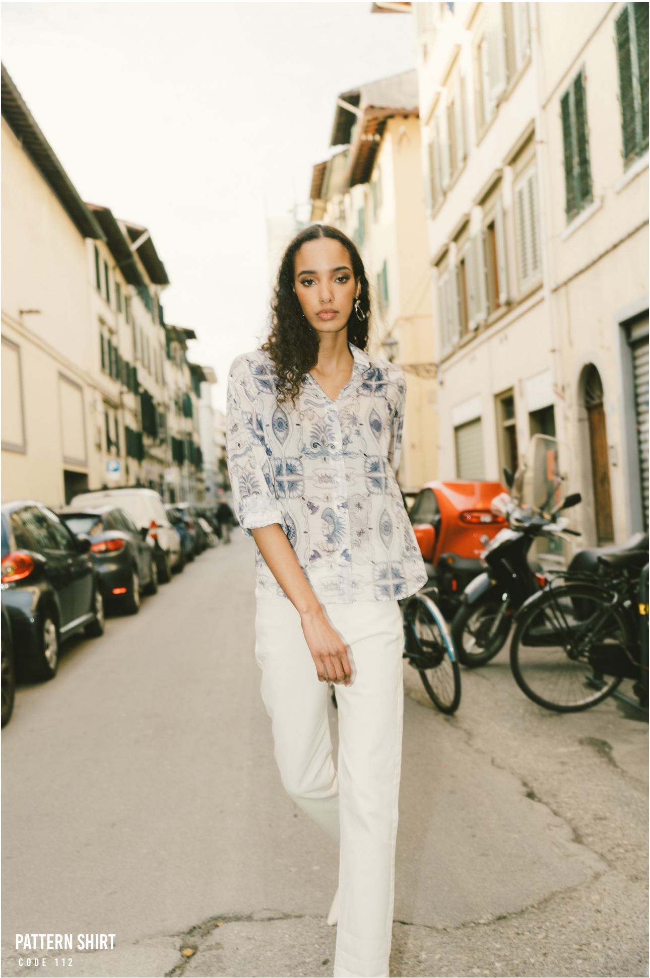
PATTERN SHIRT CODE 112