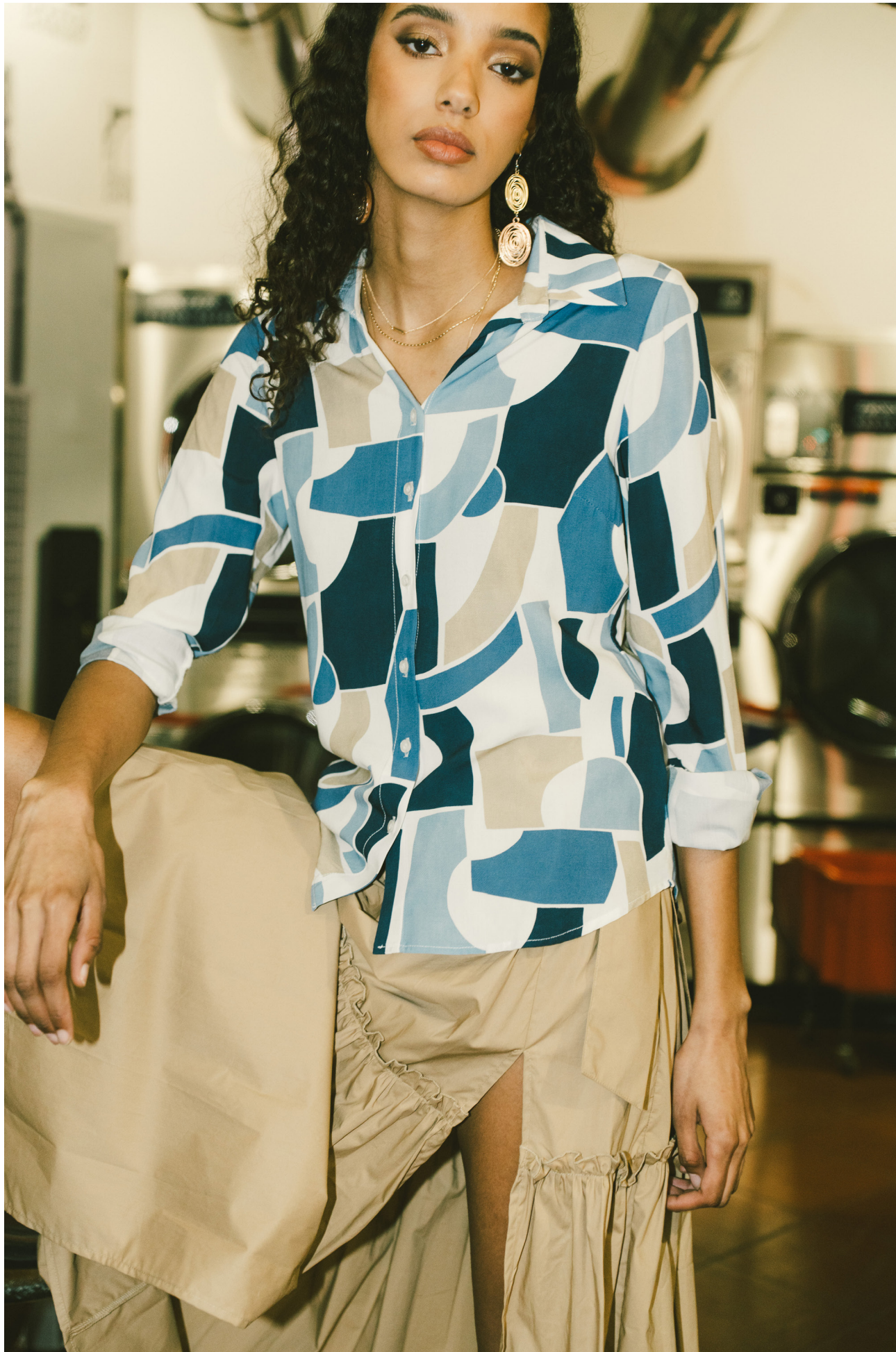
PATTERN SHIRT CODE 138