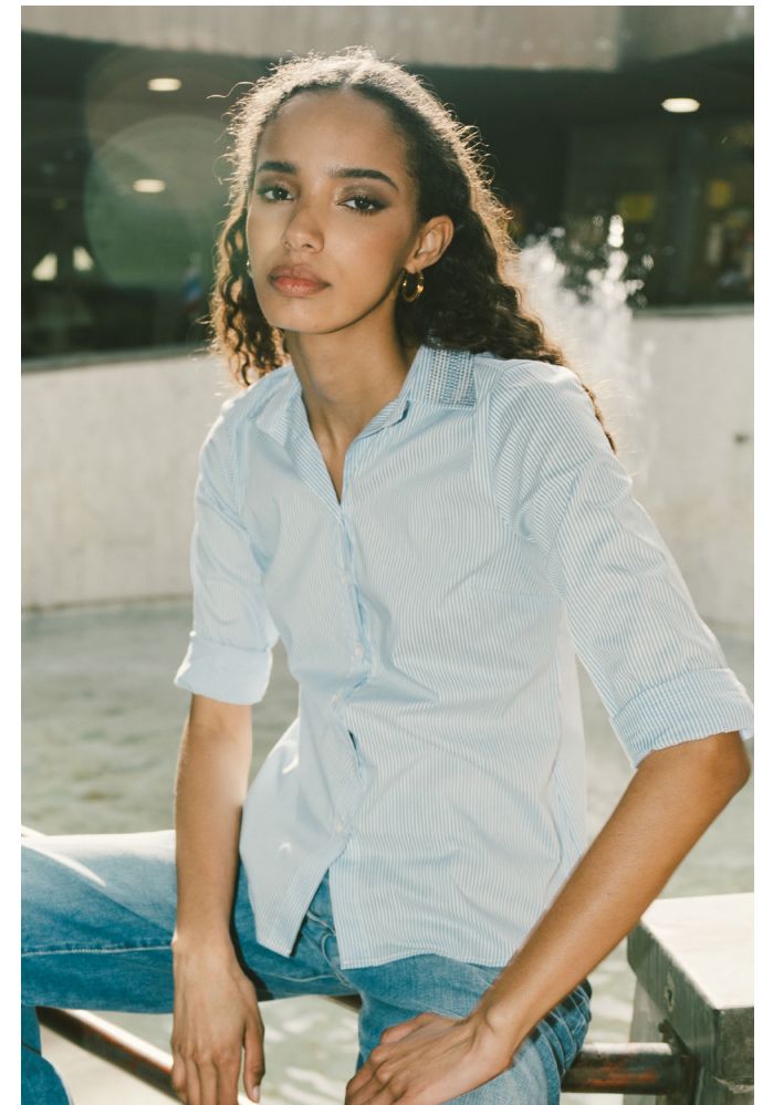
COLLAR RINestone SHIRT CODE 08