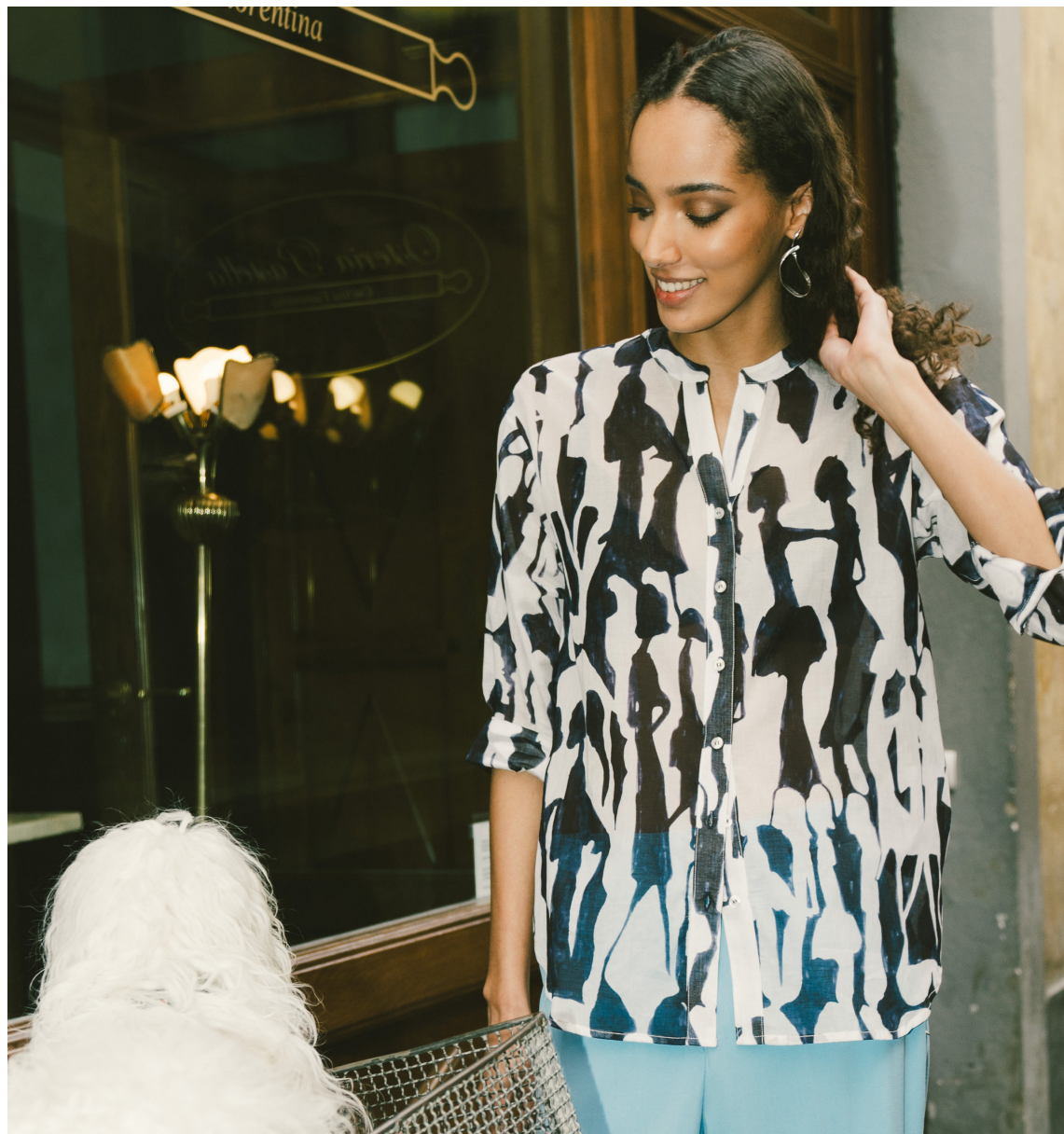
PATTERN BLOUSE CODE 129