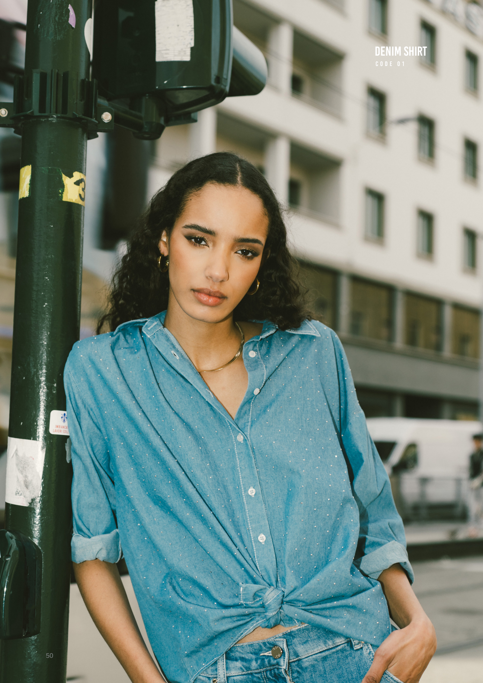
DENIM SHIRT CODE 01