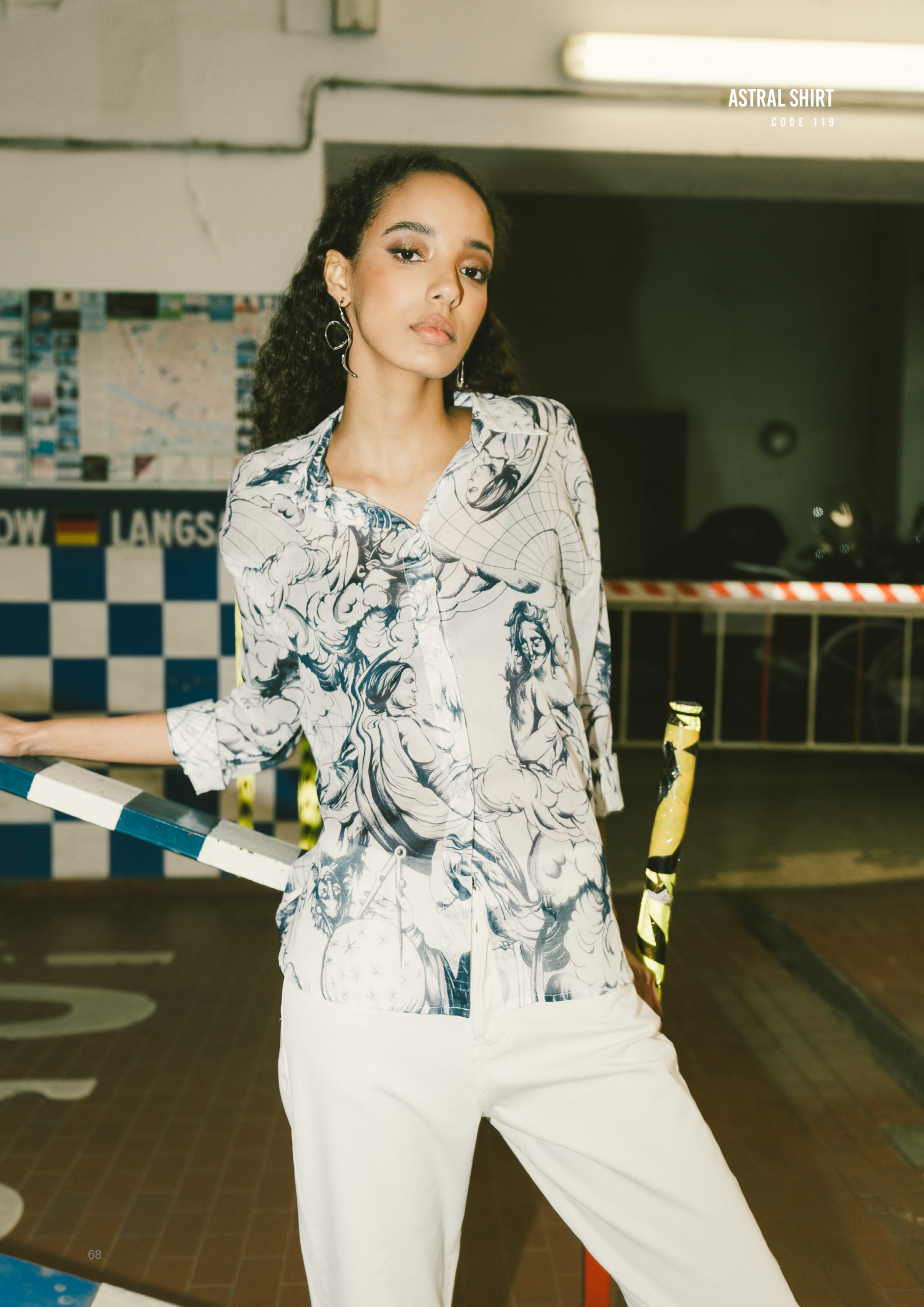
ASTRAL SHIRT CODE 119