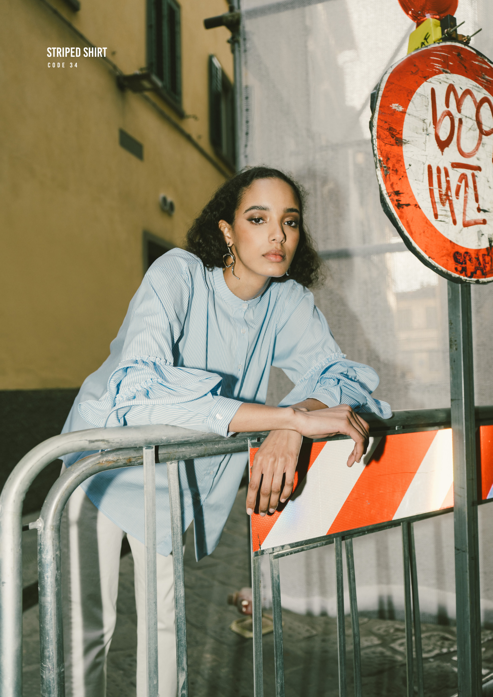
STRIPED SHIRT CODE 34