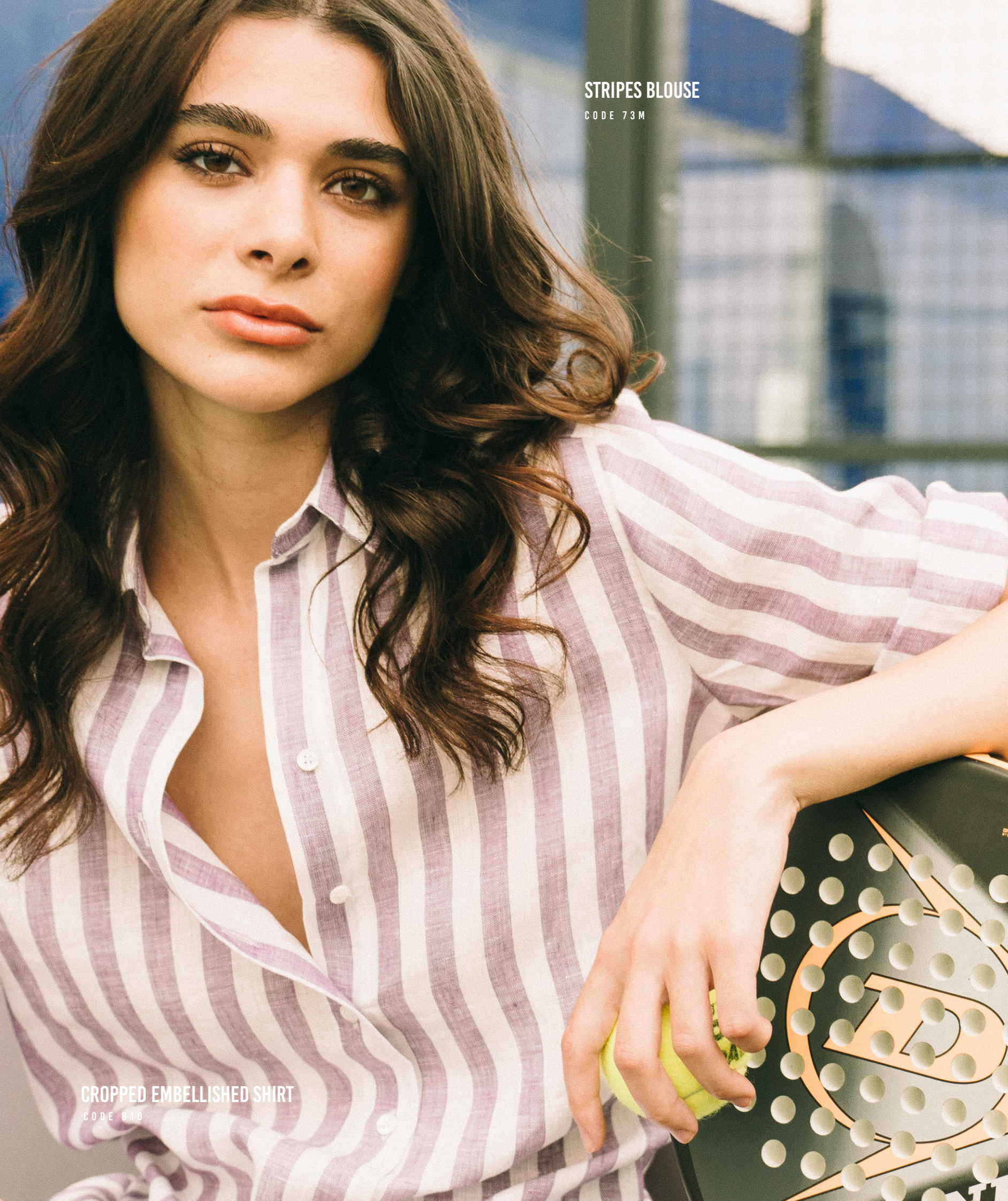
STRIPES BLOUSE CODE 73M