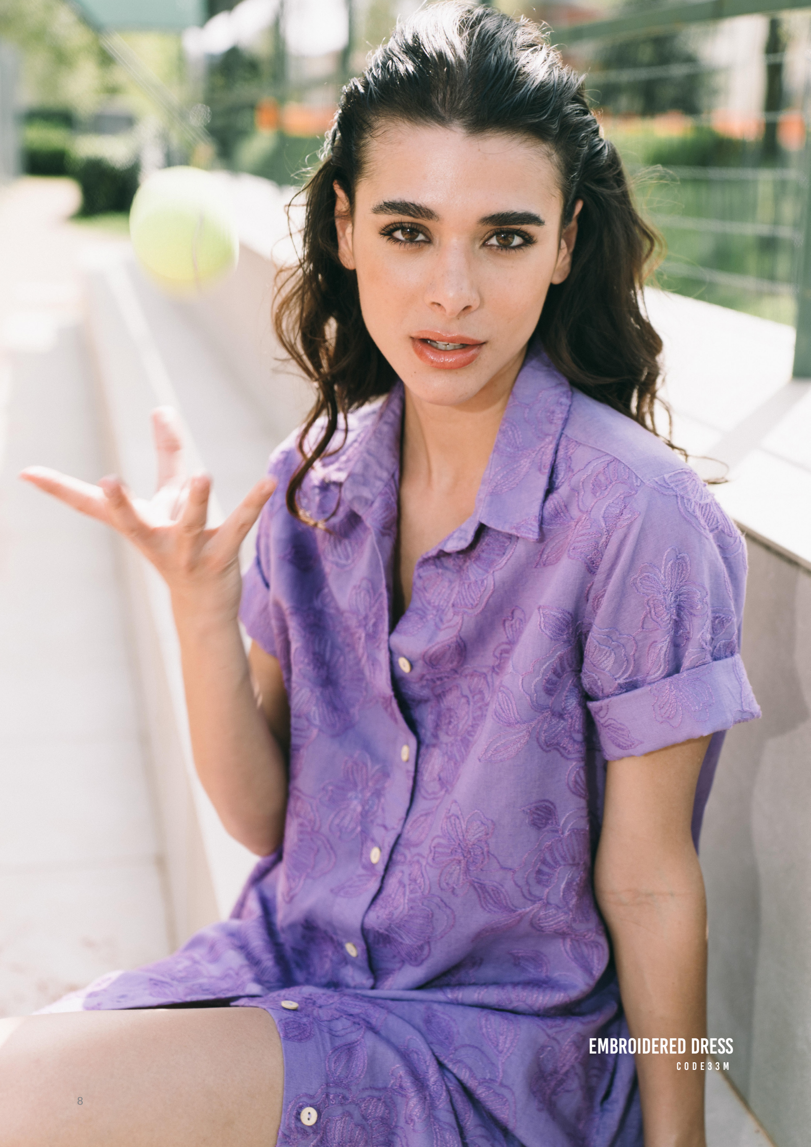
EMBROIDERED DRESS CODE33M